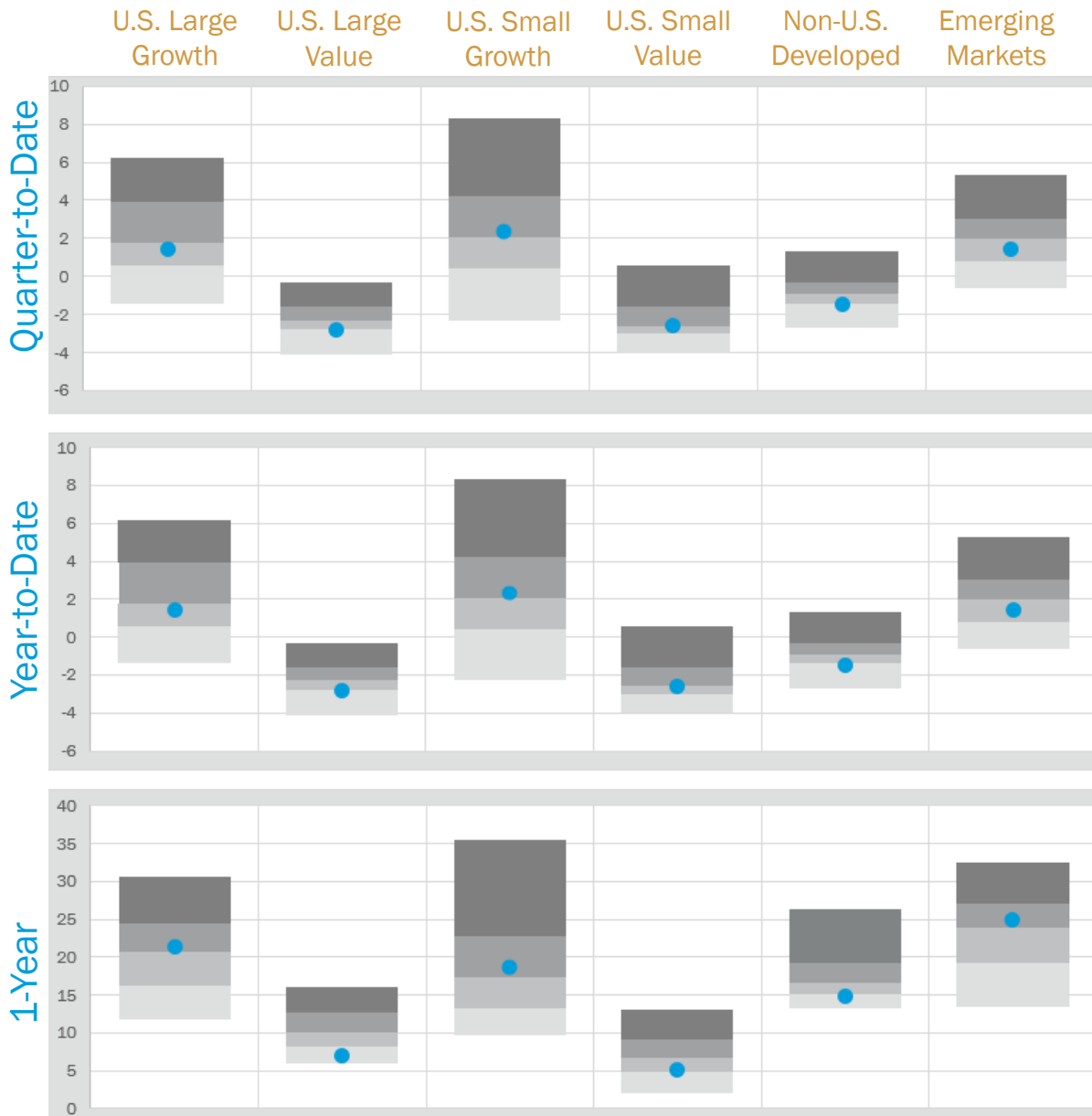
Blue dots represent the returns of the benchmark; gray floating bar charts represent the peer groups by quartile